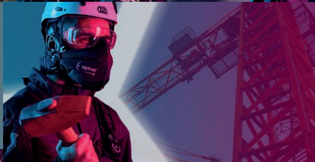
Demolition / Construction / Agriculture / Waste disposal / Recycling