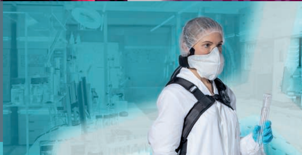
Laboratory applications / pharmaceutical industry