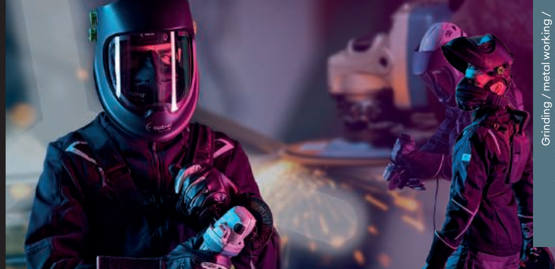
Grinding / metal working / wood working / industrial applications