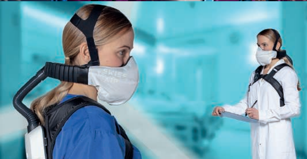
Medical applications / Health care